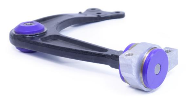
Figure 3 - fitted image showing the polyurethane bush and the metal sleeve inside the bracket and arm

POWERFLEX +44 (0) 1895 460033 sales@powerflex.co.uk www.powerflex.co.uk